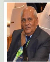
Chief Patron, RSA